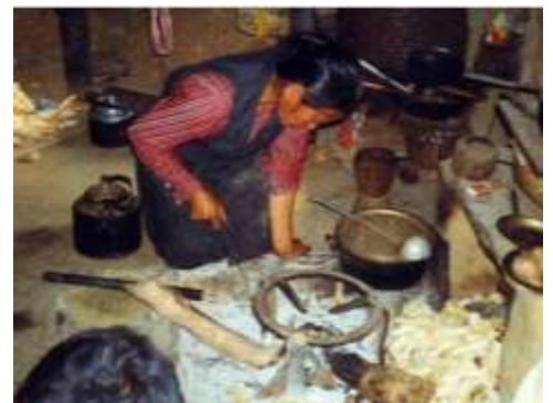
Fireplace with tripod in Nepal (K. Schulte, Sweden)