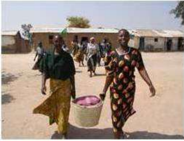
Hay basket for transport of hot dishes (Internet)