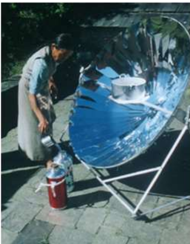
Thermos flasks in combination to parabolic solar cooker (K. Schulte: Project Solar Cookers for Nepal - Banti Bhandar, Rotary Sweden)