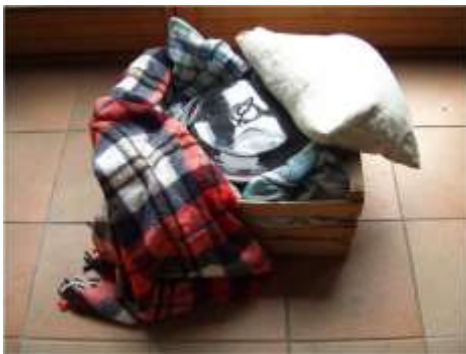
Chest with pillows and blanket