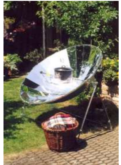
Hay basket in combination with parabolic solar cooker