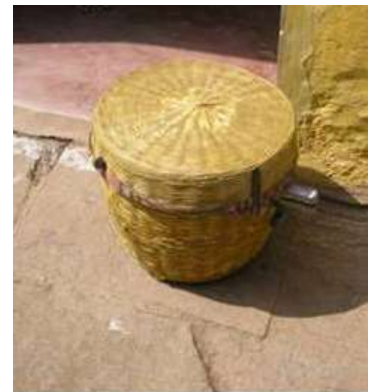
Straw basket